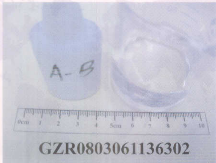
Photo of the sample

Note: -N.D. = Not Detected (<report limit )